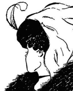
Figure 2: Is it an old woman or a young woman? Once you have seen both, you can choose which perspective to take.

One of my favourite moments of the 'It's All Invented' practice in The Art of Possibility comes from a later chapter. Ben Zander is teaching a class about leadership to students in a prestigious music school in Boston; he realises that to help the students to think freely and creatively it's important they aren't trapped into competing with others due to their worries about their grades in the class. But it's also important that they attend the class amidst a lot of pressure to get good grades, so he can't simply remove the grading system altogether. To make it worth their while, he guarantees them an A for the course as long as they write to him explaining why they deserve an A and then come to every class in the year. This, it turns out, allows them to think more freely and creatively: from a place of possibility. But what demonstrates how 'it's all invented' is when one of the students shares what has shifted for him. In his former school in Taiwan, he explains, he was ranked number 68 out of 70 students. 'I come to Boston and Mr Zander says I am an A. Very confusing. I walk about, three weeks, very